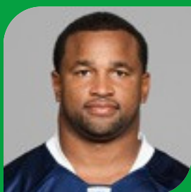
LORENZO NEAL Former NFL 7 time All Pro Fullback 14 year career