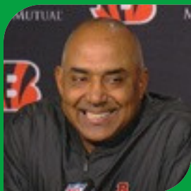
MARVIN LEWIS Former NFL Head Coach, Cincinnati Bengals